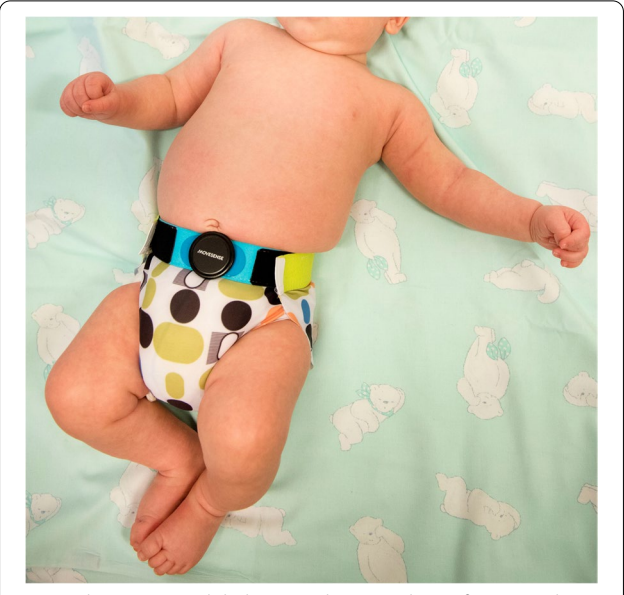
Fig. 4 Sleep pants with belt to attach sensor device for overnight actigraphy

In the same visit, a sleep video/EEG will also be performed at the INFANT sleep laboratory (Fig. 4). The timing of this should be coordinated so the recording commences following a feed around the time of the baby's longest daytime nap. The recording will last for the duration of the baby's sleep. A multichannel video EEG will be performed using the 10-20 system of electrode placement. Electrooculography, electrocardiography, respiration monitoring, and electromyography will be recorded simultaneously. The following parameters will be measured: duration of rapid eye movement (REM) and non-REM sleep stages, REM onset latency, sleep spindle number, density, frequency, duration, and